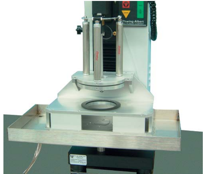
Maximizing efficient use of lab space, the burst tester is designed with a very small footprint.